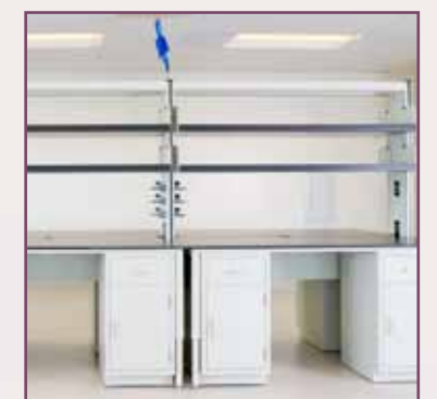
NuFlex offers multiple configurations

NuFlex THE SMART CHOICE FOR CHANGING LABS