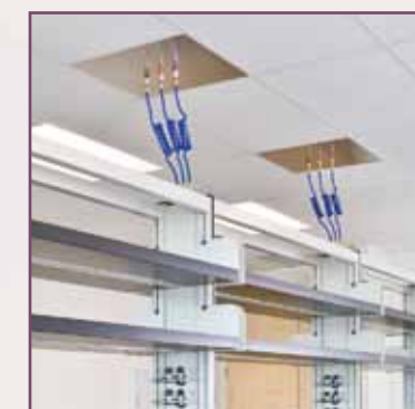
Specialty gas service connections