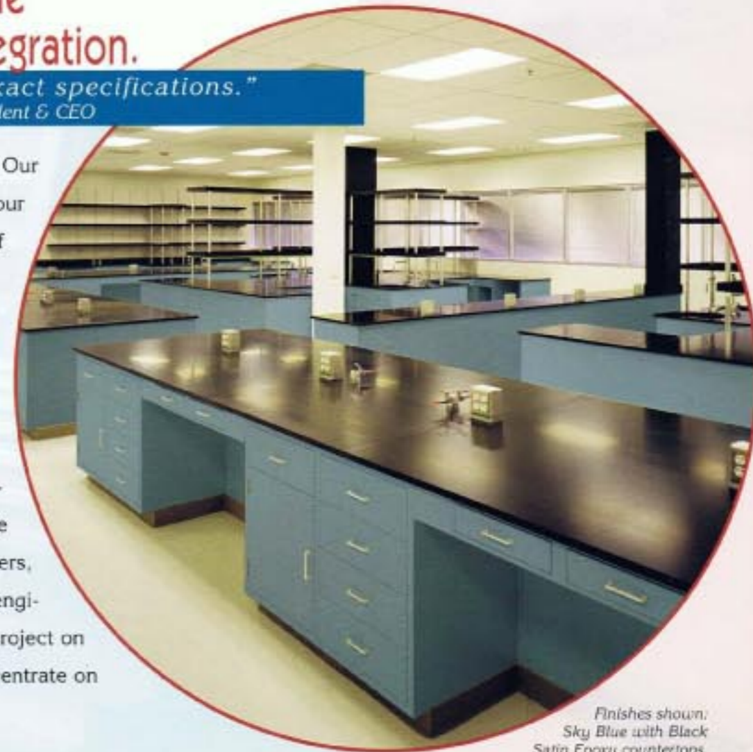
Finishes shown: Sky Blue with Black Satin Epoxy countertops.

And because we're also general contractors, we can interface with facilities managers, subcontractors and engineers to keep your project on track while you concentrate on what you do best.