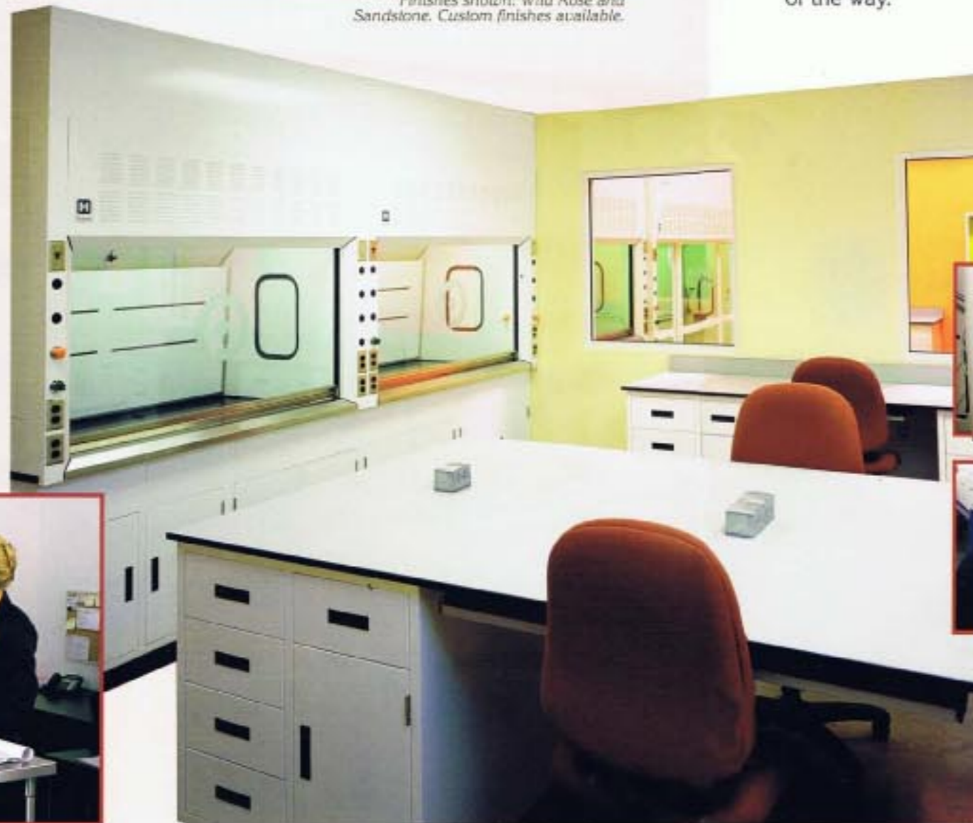
Finish shown: Antique White with Silver Grey Trespa Countertops.

Your Lab Planner will recommend composite materials compatible with your chemistries, design and build functional workstations around your exact processes, and work with your Hanson Project Manager to coordinate every aspect of your project and to keep you informed every step of the way.