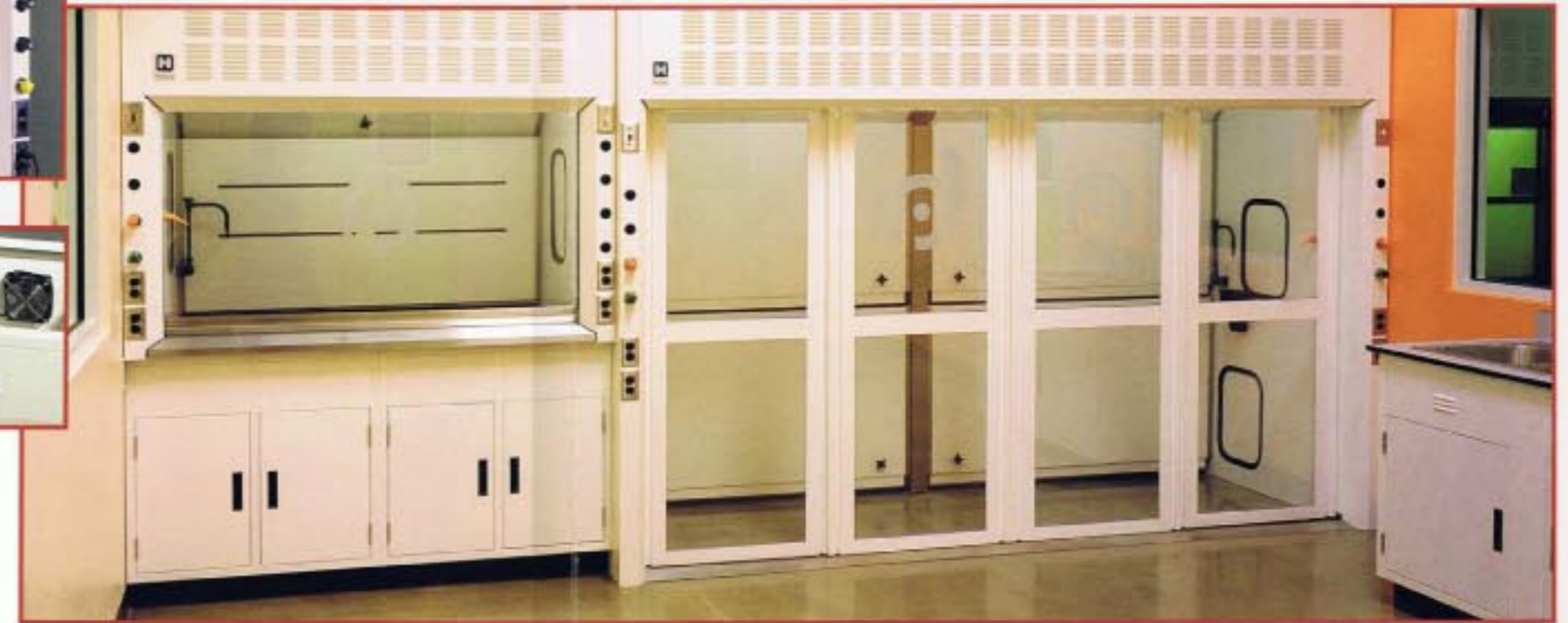
Standard Fume hoods are available in sizes from 3' to 10'. Custom sizes also available.