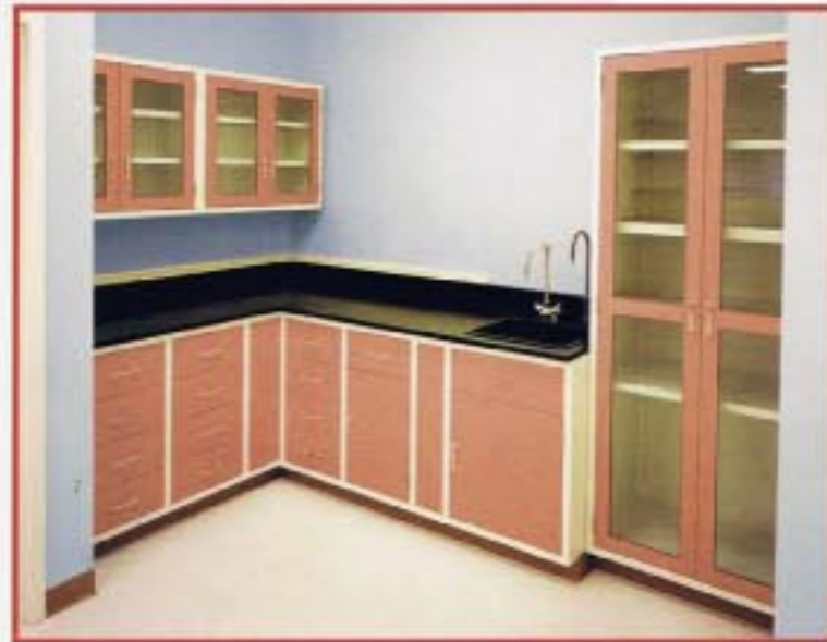
Finishes shown: Wild Rose and Sandstone. Custom finishes available.

The Hanson difference starts with the Hanson Lab Planner – a science professional who will stay with your