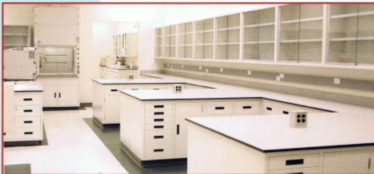
Casework, shelving, countertops and vent hoods all designed and manufactured by Hanson.